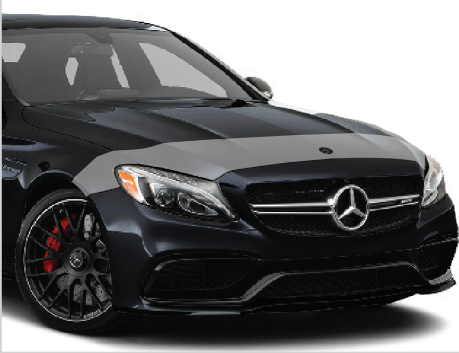
Partial Hood and Fender

Clear gloss polyurethane for stone chip protection, high wear, and abrasion in the automotive, motorcycle, RV, powersports, bicycle, aircraft, and other transportation markets.